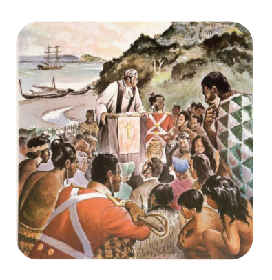
Te Mana o te Reo Māori timeline https://bit.ly/3hVGleh

There is further content available for students to explore this topic: