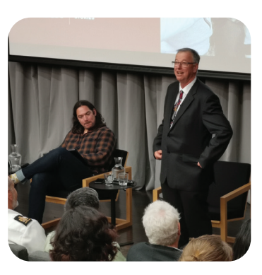
Public history talk: Te Mana o te Reo Māori https://bit.ly/3zlvdmd