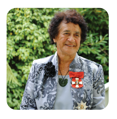
Te Mana o te Reo Māori biographies https://bit.ly/3hTBv6H