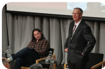
Public history talk: Te Mana o te Reo Māori