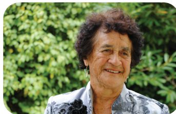
Te Mana o te Reo Māori biographies