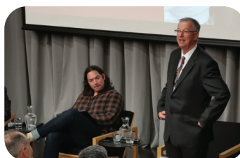
Public history talk: Te Mana o te Reo Māori